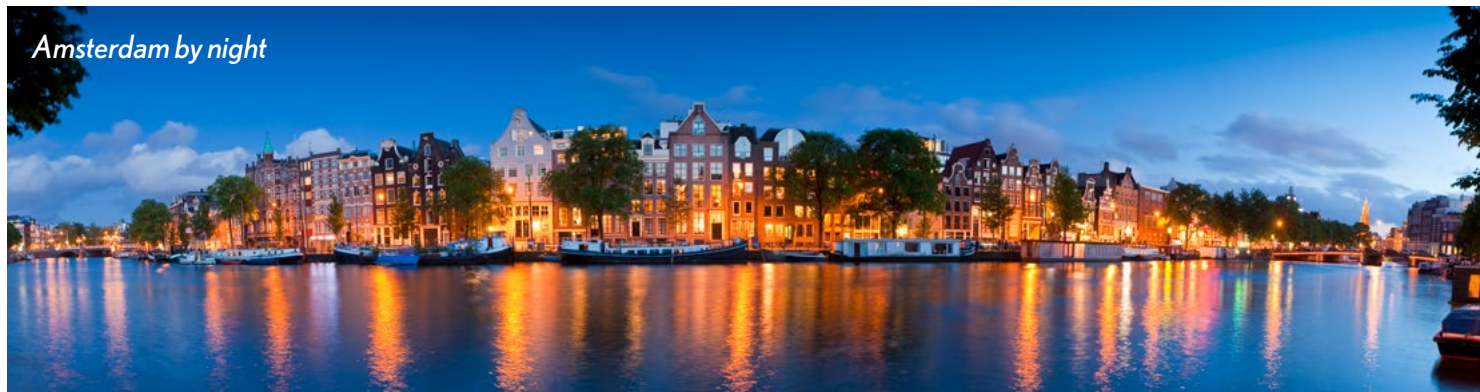
Amsterdam by night

Known for its artistic heritage, elaborate canal system and narrow houses with gabled facades, and legacies of the city’s 17th-century Golden Age, Amsterdam is also Netherlands’s capital city. The small scale of the buildings and the intimacy of the streets, canals, and squares create an atmosphere that is so unique, you’ll find yourself enamored by its charm. Adding to this city’s unique culture is cycling which is key to the city’s character and part of its allure with numerous bike paths. Of course, the Van Gogh Museum, works by Rembrandt and Vermeer at the Rijksmuseum, and modern art at the Stedelijk are some of the stars of Amsterdam’s museum district.