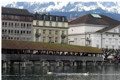
Chapel Bridge on Lake Lucerne