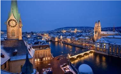
Zurich, Switzerland at night