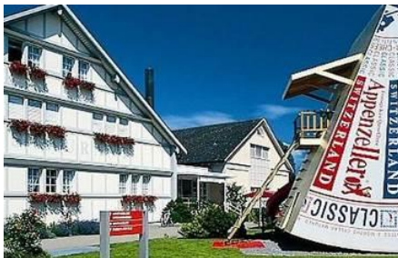
Appenzeller Cheese Factory