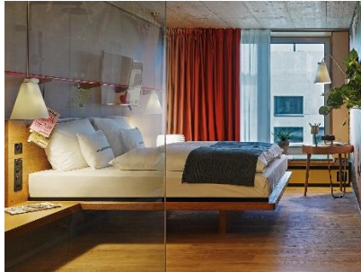
Hotel 25 Zurich, Superior L Room