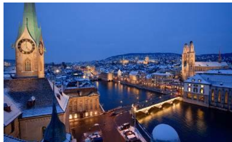
Old Town Zurich at Night