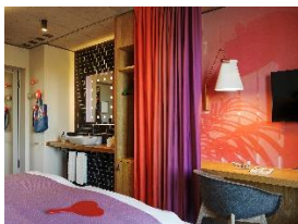
M Standard Room