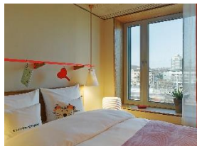
M Standard Room