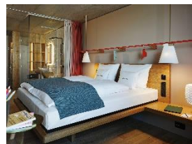
L Superior Room