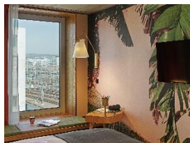
L Superior Room