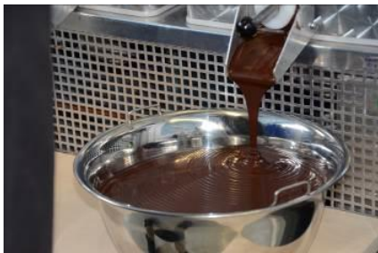
Pour your own chocolate