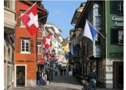
Old Town Zurich, Switzerland